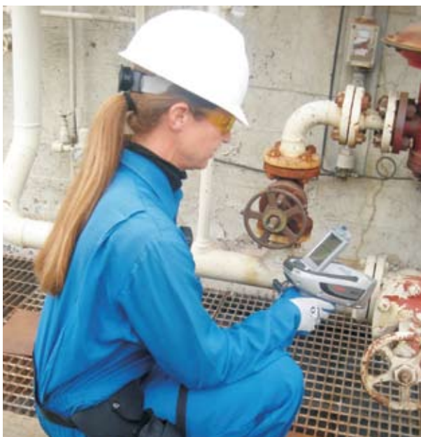
Nondestructive – reliable analysis of incoming or in-service parts..

NITON XRF instruments report a two-sigma precision along with the result for each element. This represents an error band of two standard deviations on either side of the result. The two sigma precision represents a 95 percent confidence interval for the data. Note the precision, or +/- error band, is not an indication of accuracy, but a measurement of repeatability around a most probable value. Accuracy must be assessed by comparing the measured result and precision to known values from a reference standard.