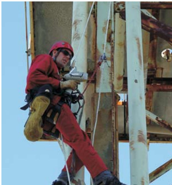
Fast, reliable positive material identification (PMI) – anywhere.