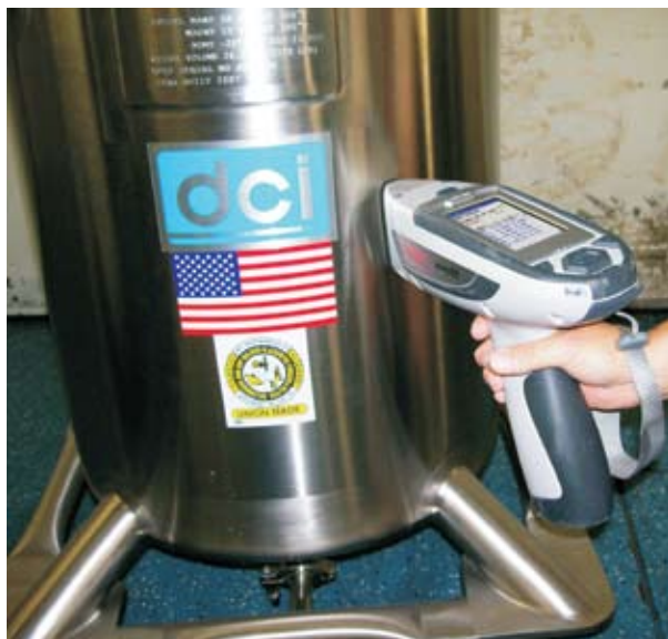
Test finished products with confidence

Yet, providing accurate alloy chemistry is only part of the equation. Using our extensive experience with the metals industry, we have incorporated an alloy grade library that simultaneously provides users with the common trade name of the alloy on the instrument display. By incorporating a hybrid approach, which combines the SAE Unified Numbering System (UNS) alloy grade specifications with knowledge of the "as produced" chemistries of these alloys, the NITON XL3 provides unmatched accuracy in grade identification.