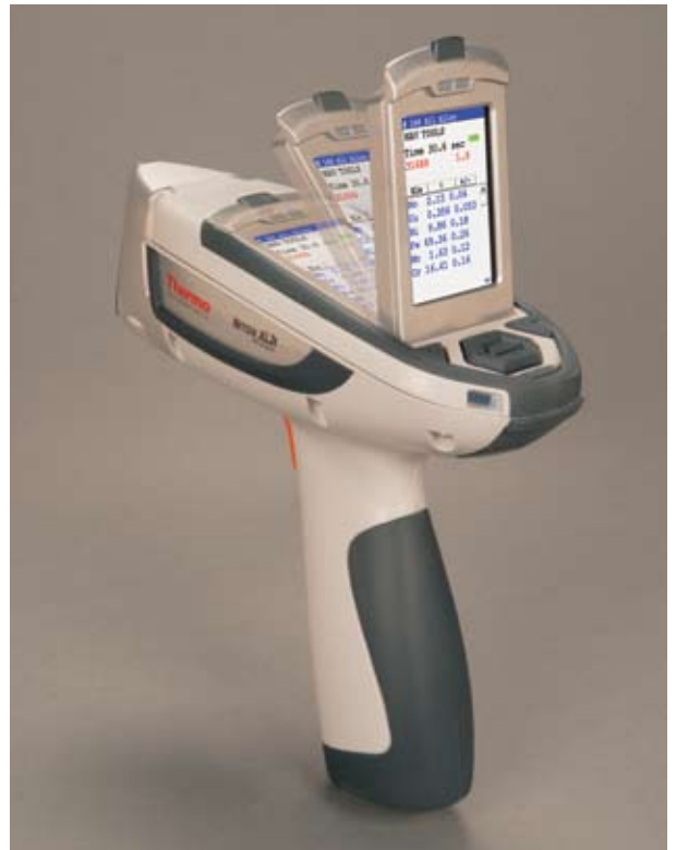
Lab quality analysis at your fingertips.